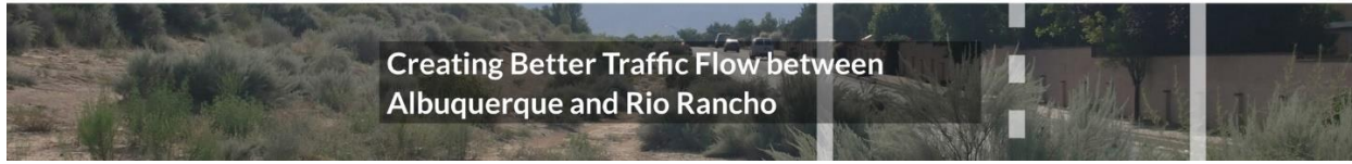
Creating Better Traffic Flow between Albuquerque and Rio Rancho